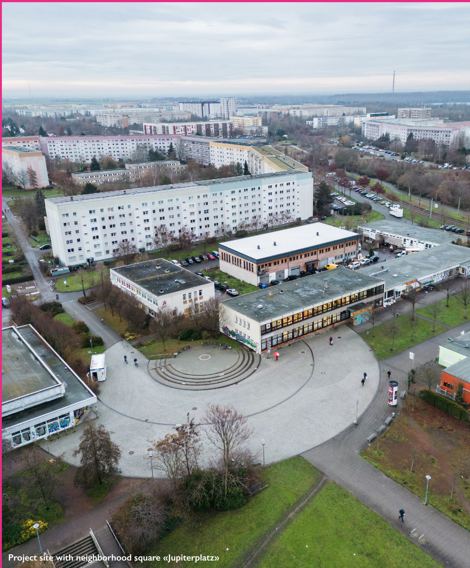
Project site with neighborhood square «Jupiterplatz»

Commission after competition: in the on-site workshops after the competition, the results are to be discussed on site and adapted if necessary. The next planned step is to commission the winning team(s) with urban planning studies.