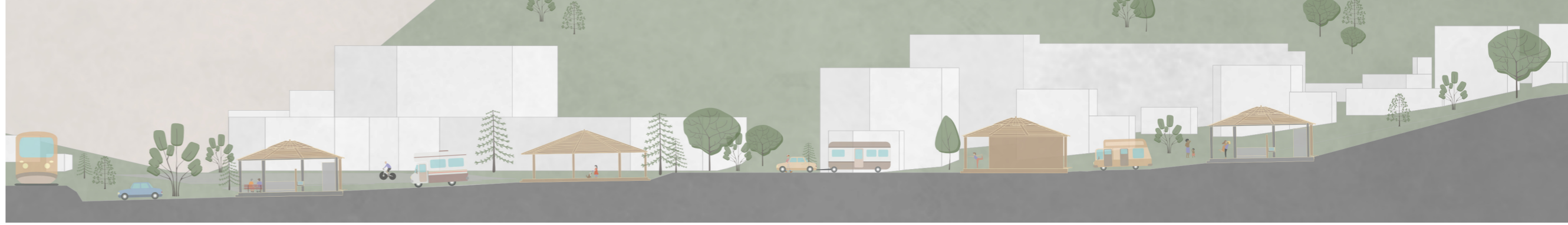
camping floor plan | section M 1:500

The campsite consists of several clusters, each equipped with their own pavilion. These contain the necessary sanitary facilities and a communal kitchen. Cars are banded in the heart of the clusters and led around them to guarantee a carefree and relaxing environment. The clusters are gathered around a common calm green space. In the north, an informative and eating kiosk is located along with a play and sports opportunity. Furthermore, a car park and the original skate park can be found.