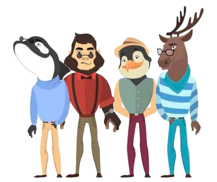
6. university students