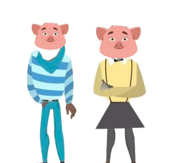
5. young individuals & couple